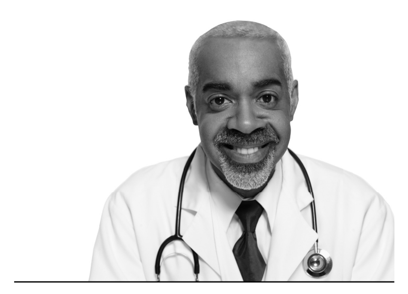
List of Plan Providers Lista de proveedores del plan